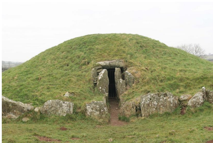
Bryn Celli Dhu, a late Neolithic chambered tomb on Anglesey https://en.wikipedia.org/wiki/Wales