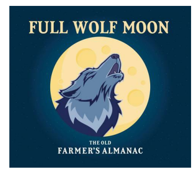
The Wolf Full Moon Friday, January 6, at 5:09 p.m. CDT

The full Wolf Moon rises on Friday, January 6, 2023, at 5:09 p.m. CDT. Learn more about when and where to howl at the January full Moon!