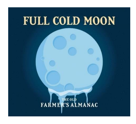
The Cold Full Moon

Wednesday, December 7, at 10:09 p.m. CDT